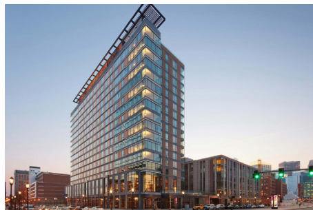
Watermark Seaport, Boston, MA