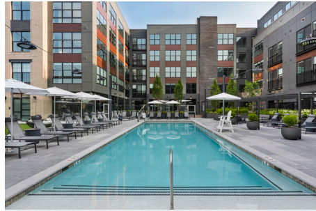
Gables Old Town North, Alexandria, VA