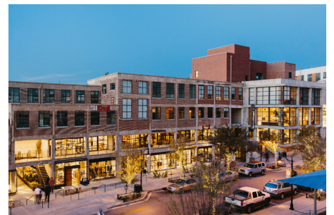
Westside Provisions District, Atlanta, GA